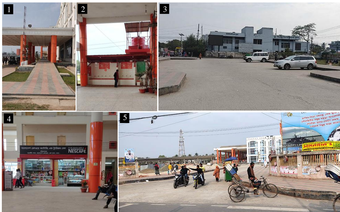
Figure 3: (1) Ramp designed at the pedestrian level for physically challenged people, (2,3) provision of drinking water and parking facilities at the new railway station, (4) Retail shops added in the waiting of the station area, (5) Entry of new railway station from the Upper Jashore Road.

The local vehicular waiting and parking facilities are prerequisites for any public station. It not only maintains traffic flow management and reduces congestion, but it also makes traveling easier. According to the physical survey, there was ample space in front of the former railway station for parking and traffic flow regulation. But mismanagement, informal use, and uncleanness make the situation complex when any train arrives or leaves the station. In the last decade, the number of private