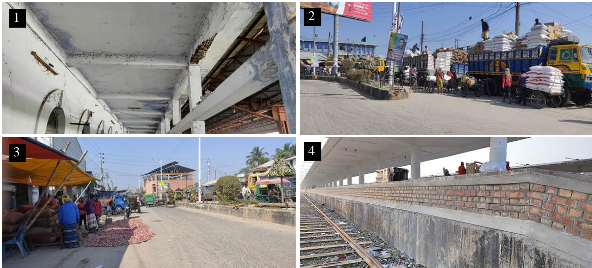
Figure 2: (1) Peeling off plaster from the roof of the old railway station, (2) Goods loading-unloading activities on the road, (3) A portion of the road is occupied for goods displaying, (4) Present platform height of new railway station after further uplifting.

introduced some challenges related to the everyday movement of people and commuters. For better communication with access roads and loading-unloading of products, many business people convert the roadside shops into selling seasonal items. The adjacent frontage of the shop is used for parking, loading-unloading, and displaying purposes. For doing this, a portion of the road is occupied by business-related activities (Figure 2). During peak time, when the products come from various areas the roadside becomes more crowded from morning till late night. Figure 2 shows, the workers initially keep the products on the road for primary sorting. More than half a portion of the road is utilized for these activities. The remaining road is not adequate for the free movement of local vehicles, such as rickshaws, vans, auto, and cars. As a result, traffic congestion is common, particularly from Power House More to BIWTA ghat.