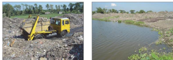
Figure 1: The transport of MSW to a landfill site (left) and crude open dumping area near surface water (right)

Significant sections of MSW still require disposal in a landfill post-reusing and recycling. Open dumping sites are inherently incompatible with the surroundings. Waste is scattered across the area due to the lack of proper management and containment systems. Furthermore, the wind carries litter outside the designated site, including surface water. The phenomenon poses a significant threat to the health of the residents and the environment. The local community also relies on groundwater for drinking, bathing, and washing. The leachate from UDS could contaminate groundwater resources in the areas, as hand pumps and tube wells are commonly located near the sites, approximately 300 m away (A. Ahsan et al., 2015; Alamgir et al., 2007). Landfill sites in Bangladesh are located in and around its cities, specifically in low-lying open spaces, unclaimed lands, riverbanks, and roadsides (Waste Safe, 2005). For example, the Rajbandh site, operated by KCC, is located 7 km from the city center.