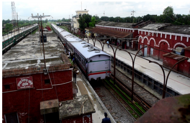
Figure 2: Ishwardi Railway Station (Junction)

The analytical research was addressed in three stages, as shown in the following Figure 3. First, an assessment of those stations current situation were done considering water and energy efficiency including buildings, service, and sustainability. Second, evaluated the water and energy efficiency of those stations. The third stage, selected measures to upgrade the water and energy efficiency of those stations.