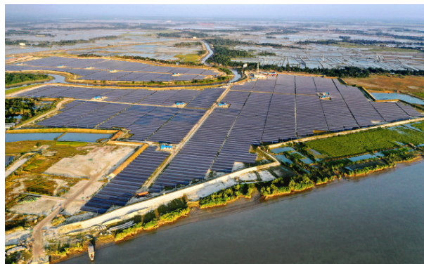
Figure 7: Bangladesh largest solar power plant, 200 megawatts (MW) at Sundarganj in

Obviously, the sun is the ultimate source of energy. Solar energy is available everywhere in the planet. The rapid decline of hydrocarbon fuels which is being used for power production forces us to find an alternative and effective source for electricity generation. However, achieving such a significant generation of power from hydrocarbon fuels like gas, coal or oil is also challenging due to their high cost, limited availability and environmental concerns and including the effect of rapid depletion of foreign reserves due to purchase those fuels.