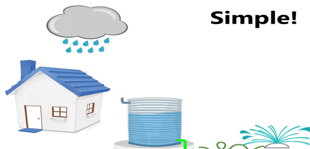
Figure 4: The simplified path of rainwater harvesting

Water efficiency refers to the decrease in the usage of water as well as decrease in the wastage of water. Wastage of water or its extra usage leads to drawing out of more water from the fresh water resources, resulting in their depletion. Thus, water efficient technologies have been developed to conserve potable as well as non-potable water and to ultimately save the already limited fresh water resources. Water efficient technologies in buildings include rain water harvesting, recycling and reuse of grey water and water saving fittings and fixtures. The major water saving is done by rain water harvesting. Traditionally, rainwater harvesting systems have been used in arid and semi-arid areas for