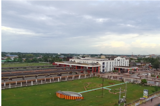
Figure1: Khulna Railway Station

This study is a cross-sectional study conducted at a divisional station in Khulna and a junction station of Ishwardi among the stations in the West Zone of Bangladesh Railway. Both qualitative and quantitative approaches were followed in this study. The selections were made according to the administrative class as the social and economic evaluation.