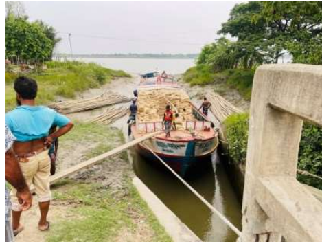
Figure 3: Transporting Rice by using an Engine boat