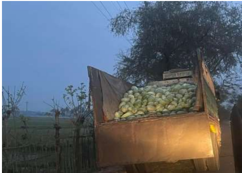
Figure 2: Transporting Watermelon by using Truck

vehicles like trucks, pickups, and mini-pickups and the other is non-road vehicles like barges, engine boats and launches. The respondents in Pankhali Union used only on-road vehicles like trucks, pickups, and mini-pickups for transporting their agricultural goods into the central market (Kadamtala, Khulna). The respondents in Tildanga Union used both on-road and non-road (water vehicles) vehicles like barges, engine boats, pickups, and mini-pickups for transporting their agricultural goods into the central market (Kadamtala, Khulna). They used mini-pickups, nosimons (big shallow engine vans), and motor vans to shift agricultural goods from the primary storage center to the local market. Fig 2 and 3 shows the transporting mode in the study areas.