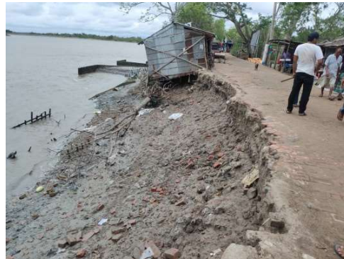
Figure 6: River Bank Erosion