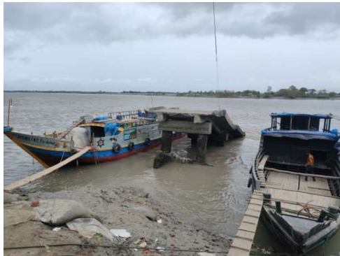
Figure 5: Water Vessels Ghat of Tildanga Union

Natural calamities damaged the agricultural crops, animals, poultry, trees, buildings, roads, polders almost everything of farmers although the degree of damage varied depending on the type of disasters they faced. The destruction of road networking systems made it difficult for farmers to transport their goods to market, and increasing their economic challenges. They highlighted the importance of timely transportation to ensure the freshness and quality of agricultural crops during market distribution. During cyclones hit the study area, roads side trees fell on the roads, as a result the vehicles cannot move to their destination in time and the agricultural goods get spoiled due to time consumption. Fig 5 and 6 shows the disaster impacts on water vessels ghat and road network.